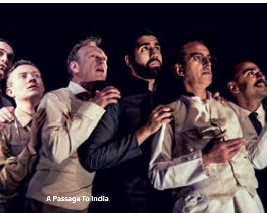
A Passage To India