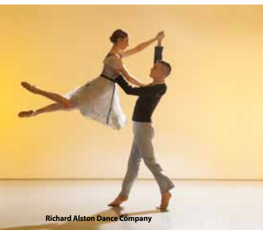
Richard Alston Dance Company