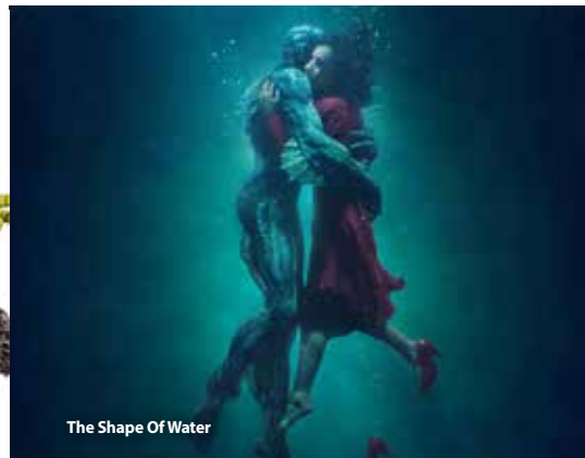
The Shape Of Water