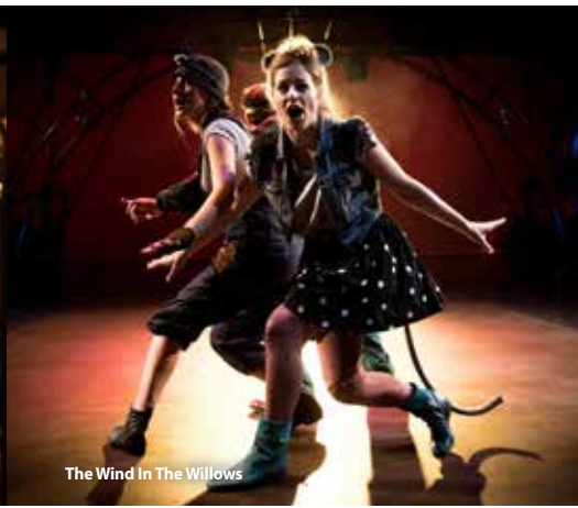
The Wind In The Willows